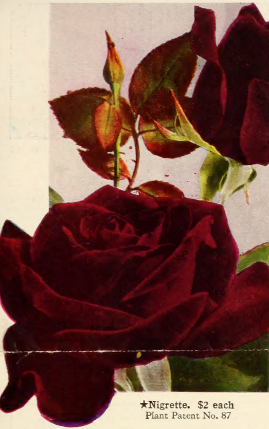
★Nigrette. $2 each Plant Patent No. 87

RECEIVED ★ OCT 30 1934 U. S. Department of Agriculture